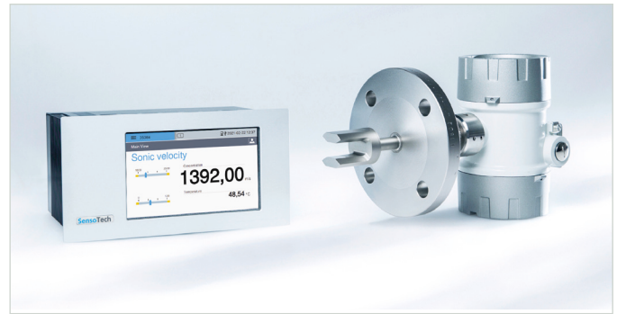
LiquiSonic ® controller and immersion type sensor

concentration range of H_2SO_4 : 80 wt% to 100 wt% temperature range of H_2SO_4 : 20 °C to 90 °C